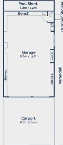
(Not In Position).