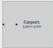
Lower Ground Level.