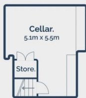
Lower Ground Floor.