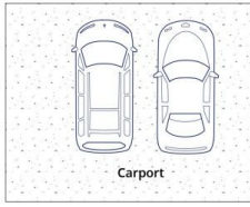
Carport (Not In Position)