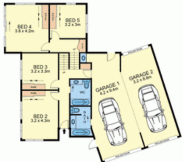
LEVEL 1 & LEVEL 2